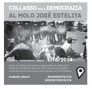
Source: Photo by Sabrina Tenório, International movement of support for the occupation of Cais Estelita .

Figure 2: Support for the movement in Italy