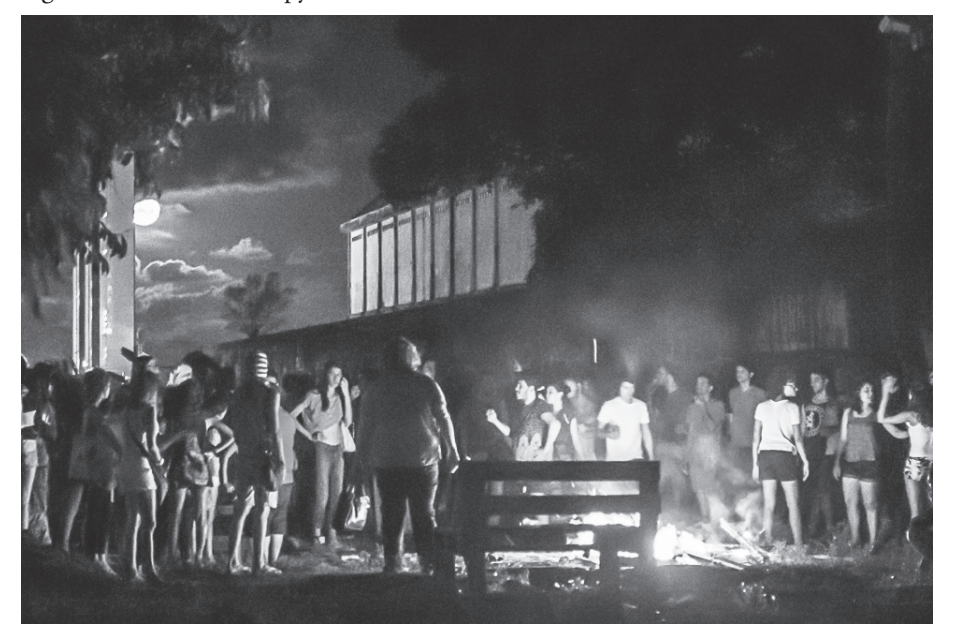
Figure 6: Militants occupy the Cais Estelita once more