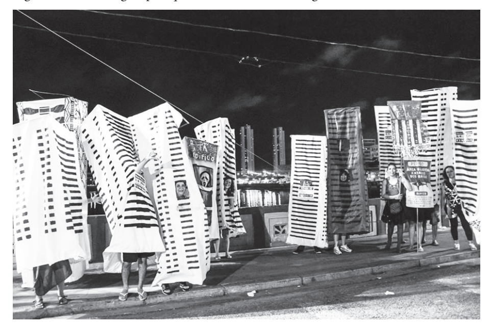
Figure 8: Carnaval group Empatando tua vista showing the "Twin towers"