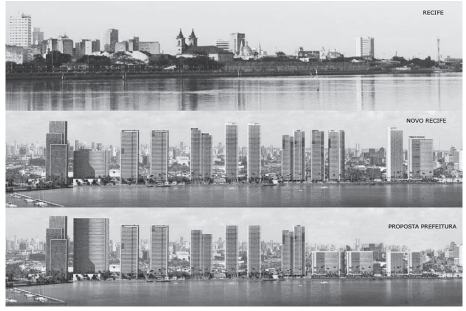
Figure 4: Simulation of the proposed remodelling presented at Recife Town Hall

times; this is a further example of the movement's clear capacity to react positively to adverse events.