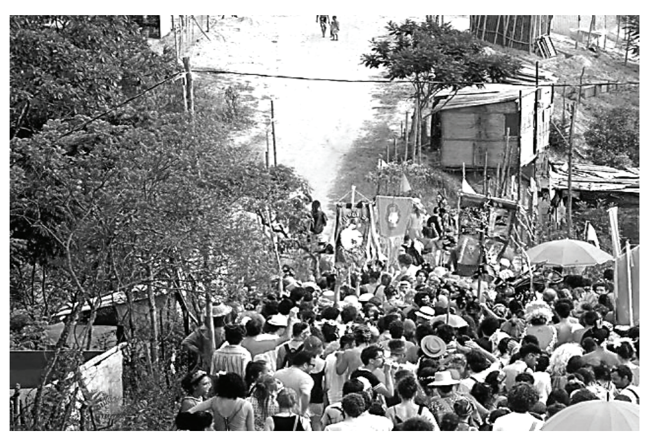
Figure 2: Appropriation of the dirt roads in the Rosa Leão squat, on the borders of the municipalities of Belo Horizonte and Santa Luzia, by the carnival block Filhos de Tcha Tcha , in 2014

of the Jornadas de Junho – referring to a series of political demonstrations throughout many different cities across the whole of Brazil in June 2013, which brought millions of people onto the streets. Currently, according to data from the movement itself, the Rosa Leão , Esperança and Vitória squats are home to around 1,500, 2,500 and 4,500 families, respectively (OCUPAÇÃO ROSA LEÃO, [201-?]; OCUPAÇÃO ESPERANÇA, [201-?]; OCUPAÇÃO VITÓRIA, [201-?]. All are located in the region known officially as Isidoro (terminating in "O") or, according to militants within the movement, Isidora (terminating in "A"). The region, located in the far north of Belo Horizonte, is the very last large vacant plot of land owned by the municipality, and is also of great environmental relevance. According to official data, this region is larger than the area originally planned and implemented at the end of the nineteenth century to accommodate the entire urban area of the new capital of the state of Minas Gerais (BELO HORIZONTE, [201-?]).