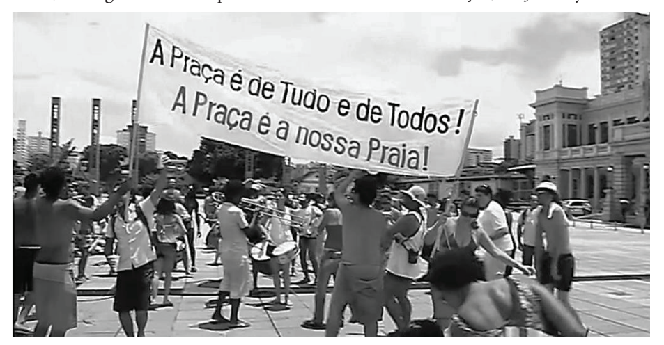
Figure 1: Festive appropriation and contestation of Praça da Estação in Belo Horizonte, during the first occupational movement Praia da Estação , on January 7<sup>th</sup> 2010

In the biennium 2009-2010, the first major expansion of street carnival occurred when several other blocks were established, and which have already come to be considered traditional in the Belo Horizonte street carnival, both during the pre-carnival period as well as during the official carnival holiday. In 2009, three blocks were created, and in 2010, seven new blocks appeared (PODIA SER PIOR et al., 2012), many of them influenced by a movement that claimed the right to use a square called Rui Barbosa<sup>2</sup>, and known as Praia da Estação (Station Beach). This movement emerged in January 2010 as a reaction to a local government decree that legally imposed restrictions on holding events of any kind in the square (BELO HORIZONTE, 2009). Organised through the Internet, Praia da Estação offered a new form of civil political expression, by proposing an urban intervention with performances and festivities metaphorically transforming the square ( Praça da Estação ) into a kind of beach (IMAGINA NA COPA, 2013).