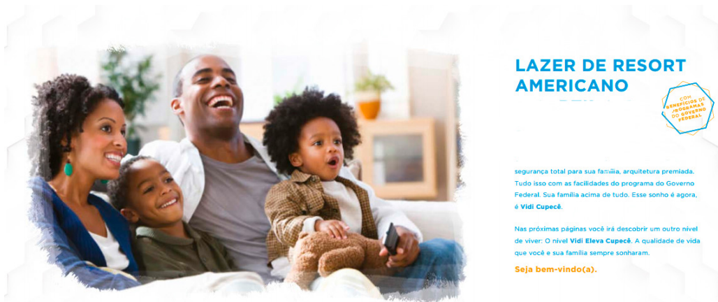
Figure 4. Advertising material for the Vidi Eleva Cupecê enterprise: “Leisure like in an American resort”