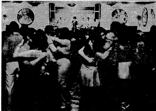
Jardim Miriam, recanto nordestino, dos forrós, dos "bailes de família"