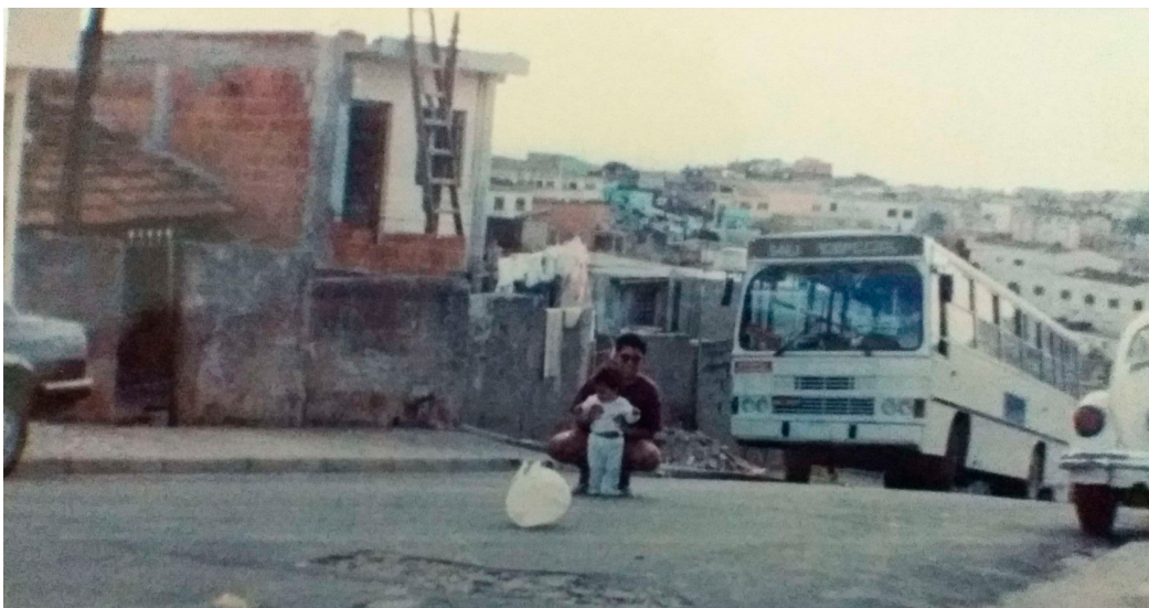
Figure 1. My father and I in front of our home

she plans to know. My body rebels against its condition of object in the field of ideas and now I no longer wish to access this place that is denied me. On the contrary, I long for the dissolution of this abstract field, seeking something written that brings feeling and thinking closer together, that repositions my body into a place where theory and practice, affectations and abstractions are not separate, split apart fields. I arrive here tired of cloistering myself as far as modern grammar has allowed me to go, each day less insecure about the paths that open up through its critique.