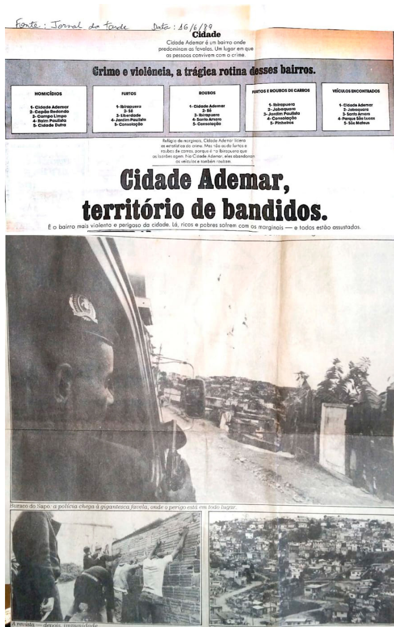
Figure 6. Cidade Ademar, bandit territory: Crime and violence, the tragic routine of these neighborhoods