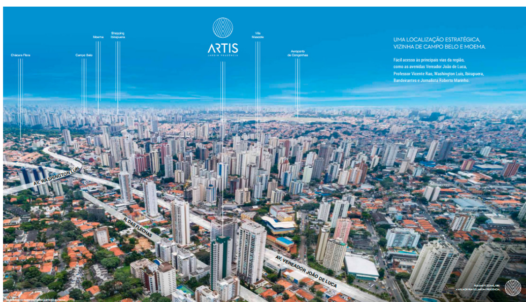
Figure 5. Advertising material for the Artis Jardim Prudência enterprise: “An upscale neighborhood near the districts of Campo Belo and Moema”. How the real estate development advertising brings their buildings together with upscale neighborhoods

The relentless narrative of bringing together the enterprises and other “upscale districts” – richer, whiter and, consequently, with better infrastructure – links the enterprises launched to neighborhoods in the southwest axis of São Paulo, a region occupied by the white middle and upper classes, with strong social cohesion, which, through various direct and indirect strategies, keeps the Black population at a distance (FRANÇA, 2017, p. 176). Closer to the not-so-distant front of the real estate expansion of the City , these enterprises are also approaching the future and the progress that the new economic center of São Paulo promises – promises of a new life of freedom that only this modern rationality may achieve.