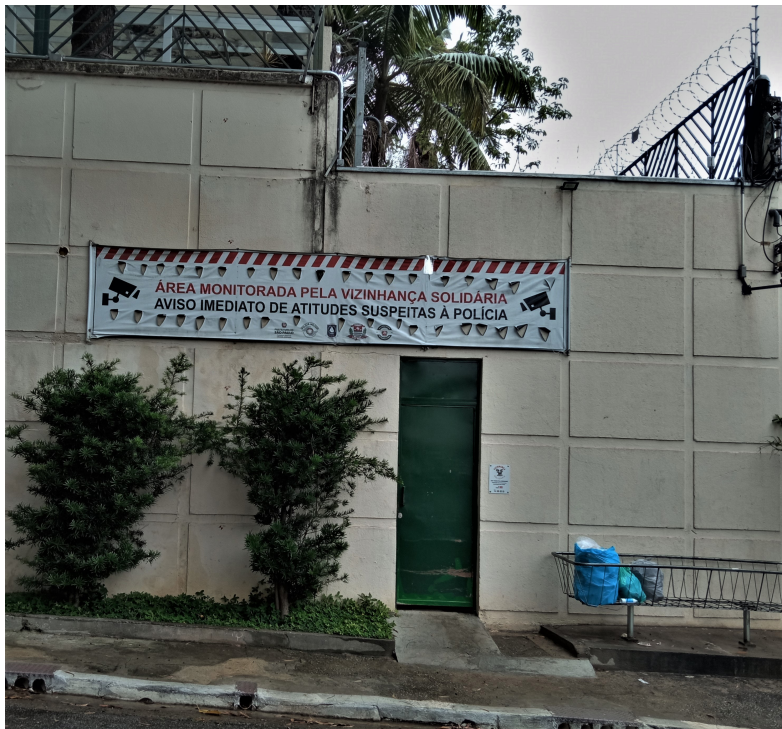
Figure 2. Solidarity neighborhood, Jardim Prudência