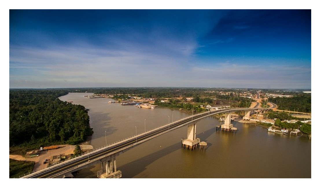
Figure 2. Bridge over the Matapi River Source: Alex Silveira/Amapá State Government (2016).

regard to the relationship between Macapá-Santana and Mazagão, is an example of the political tardiness regarding the materialization of the integration agenda. Part of this is explained by the private service of transporting cargo and passengers previously carried out by ferries and also by the constant delays in the work.